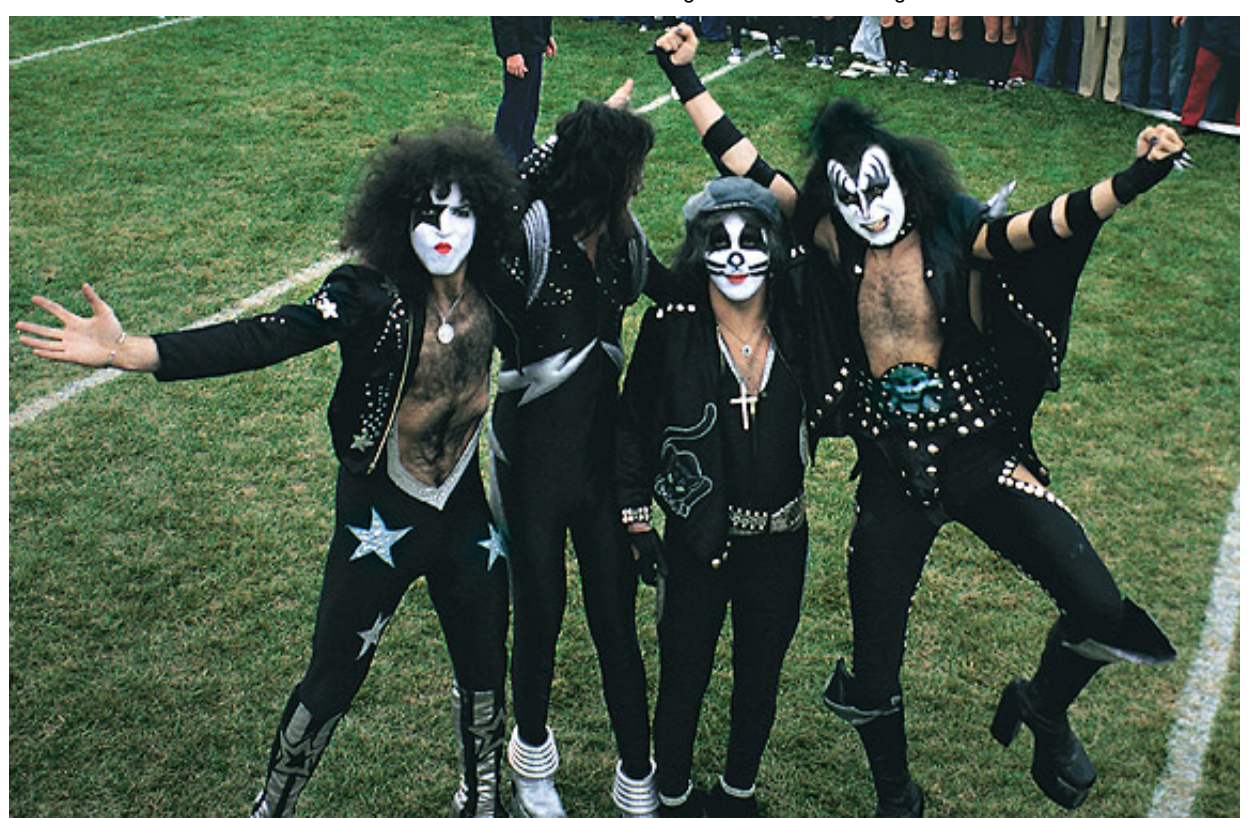
The Homecoming parade ended at the football field, where the band members began their goodbyes.